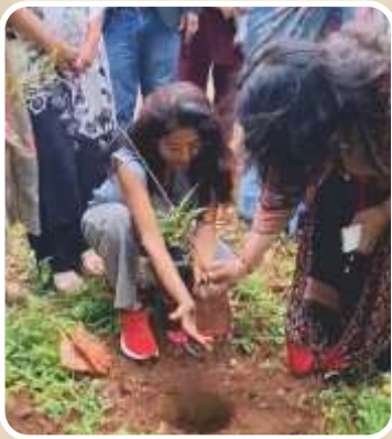
July 13 th ← Project no. 18, Plantation at people for animals premises.