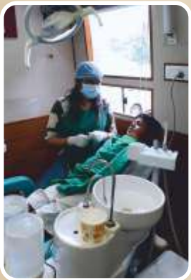
July 18 th ← Project no. 19, Dental Checkup & Treat of students.