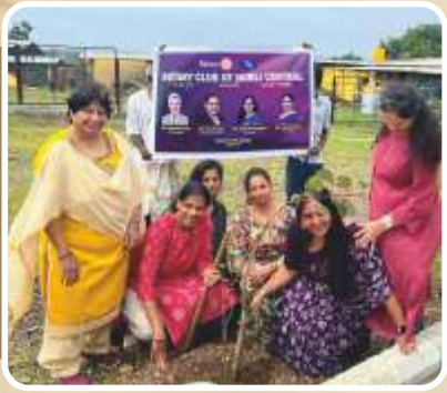
July 5 th → Project no. 6, Tree plantation at Rotary forest.