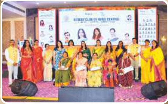
July 12 th → Project no. 16, Financial aid for school uniform.