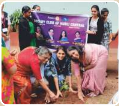
July 10 th ← Project no. 10, Tree Plantationat MVP, Hubli.