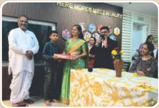
July 25 th → Project no. 25, Awareness & Free Fertility Checkup Camp At Spandana Hospital, Janani Fertility & Shree IVF Clinic.